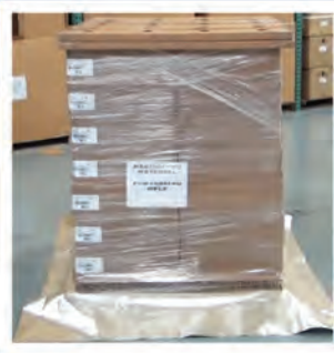
» Gel sleeves top protection