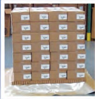
» Bottom wrap and pad