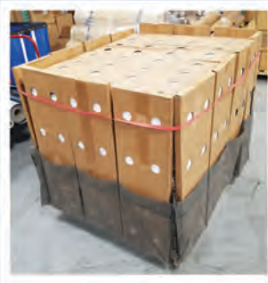
» Full protection on sides and top