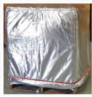
» PalletQuilt® and bottom wrap sealed

NEW! Multiple pack-out options to fit your specific protection requirements.